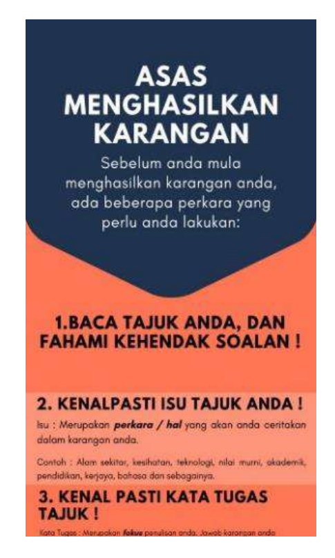
Figure 1: Bijak Karangan presents the Rules of Thumbs on How to Write a Proper Essay