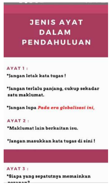
Figure 2: Bijak Karangan contains Caveats in Essay Writing